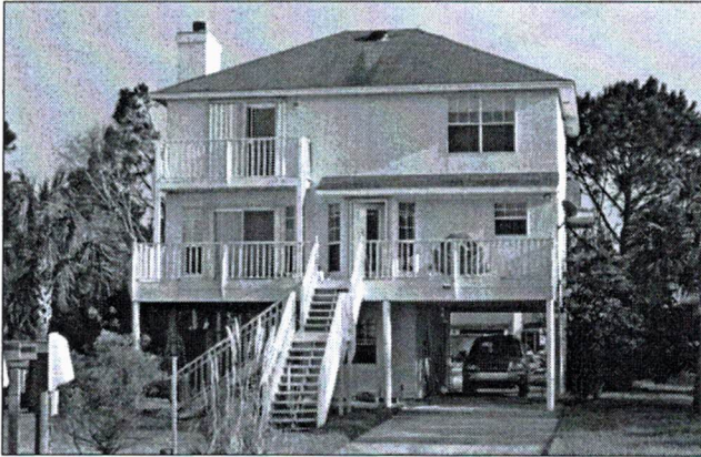
Elevated home on pile foundation