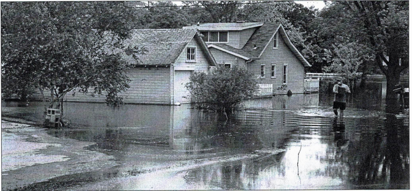
Janesville, Wisconsin, 2008