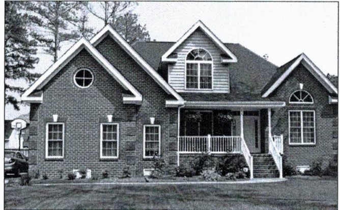
Elevated home on crawl space foundation

make conventional loans for insurable buildings in flood hazard areas of non-participating communities. However, the lender must notify applicants that the property is in a flood hazard area and that the property is not eligible for Federal disaster assistance. Some lenders may voluntarily choose not to make these loans.